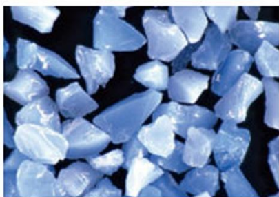
Strong Premium Ceramic Grain